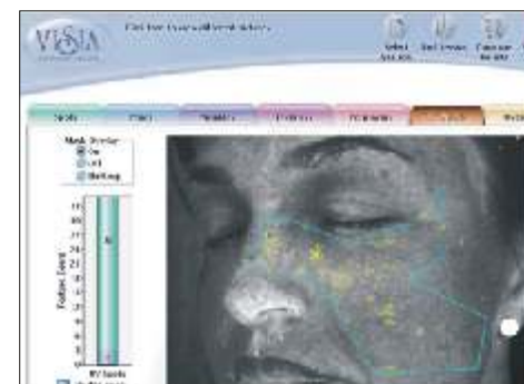
UV Spots analysis