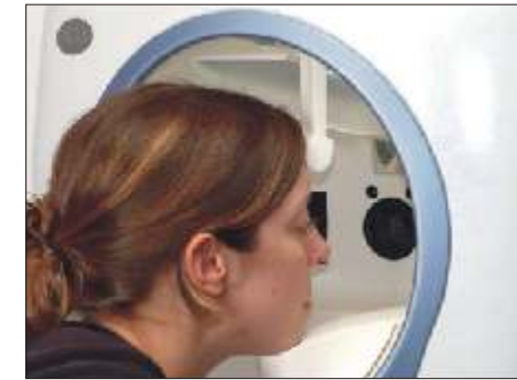
Patient positioning in visia